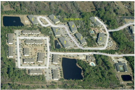
Built in 2004 - 178 units - 3 floors

VILLA SAN MARCO CONDOMINIUM ASSOCIATION, INC 1637 RACE TRACK RD # 206 ST JOHNS FL 32259 PHONE 904-561-9708 FAX 904-461-0335 https://