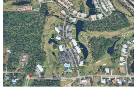
Built in 1985/2005 - 80 units - 2 floors

Number of units: 80 Number of active listings for rent: 1 Number of active listings for sale: 2 Building inventory for sale: 2% Number of sales over the last 12 months: 8 Number of sales over the last 6 months: 3 Number of sales over the last 3 months: 0 Gator Trace Master POA c o Signature Property Mgmt PO Box 161029 Altamonte Springs FL 32716-1029 https://gatortracemasterassociation.com/