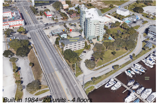
Built in 1984 - 20 units - 4 floors