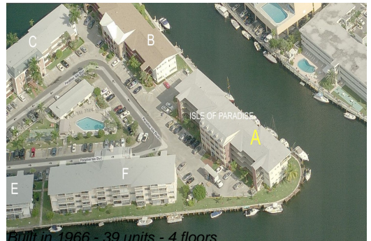
Built in 1966 - 39 units - 4 floors