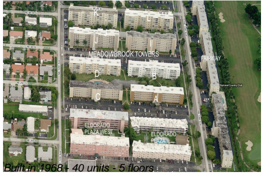
Built in 1968 - 40 units - 5 floors