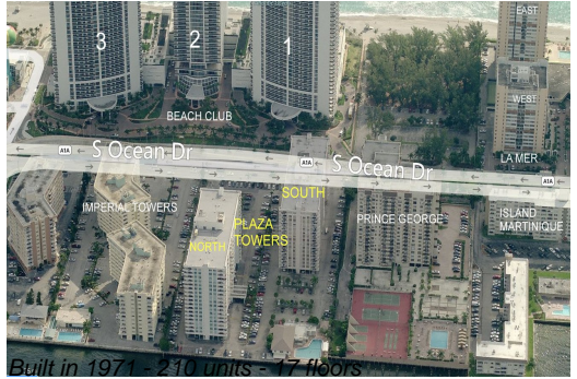
Built in 1971 - 210 units - 17 floors