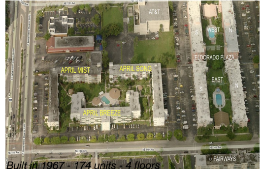
Built in 1967 - 174 units - 4 floors