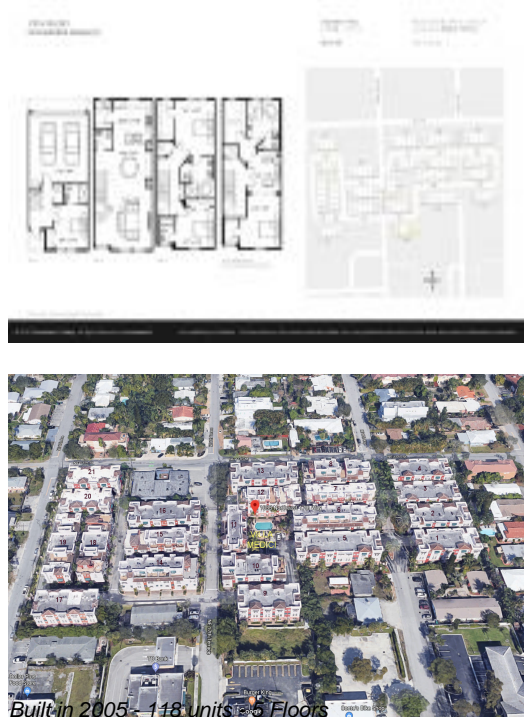
Built in 2005 - 118 units - 6 Floors