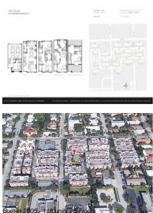
Built in 2005 - 118 units - 6 Floors