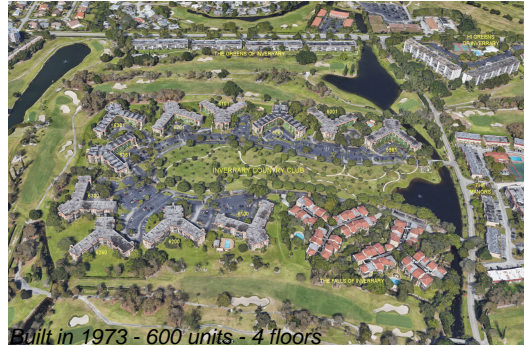
Built in 1973 - 600 units - 4 floors