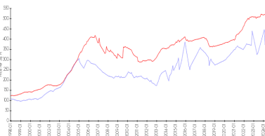
Lauderdale by the Sea vs Broward