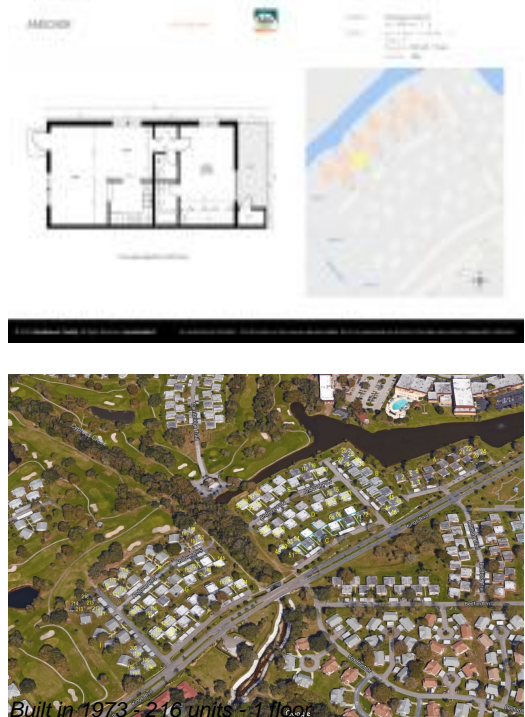
Built in 1973 - 216 units - 1 floor