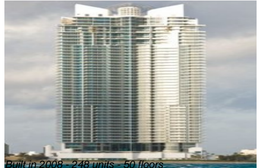
Built in 2008 - 248 units - 50 floors