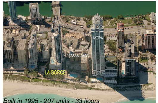
Built in 1995 - 207 units - 33 floors