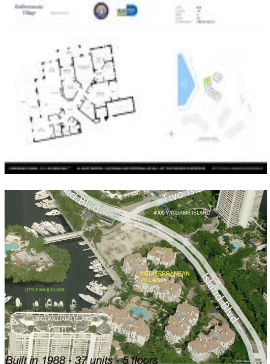
Built in 1988 - 37 units - 5 floors