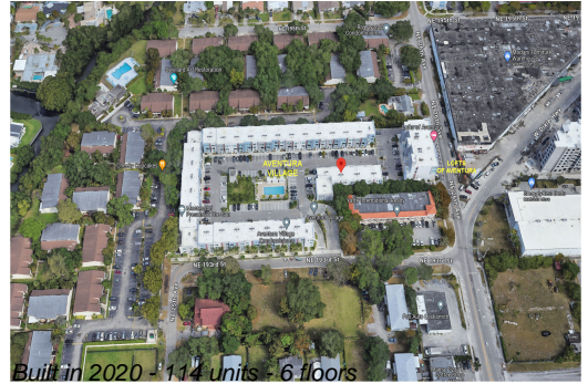
Built in 2020 - 114 units - 6 floors