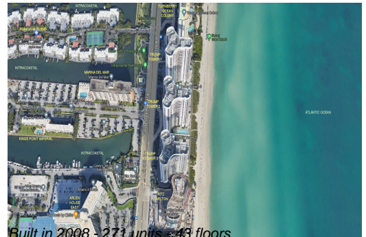
Built in 2008 - 271 units - 43 floors