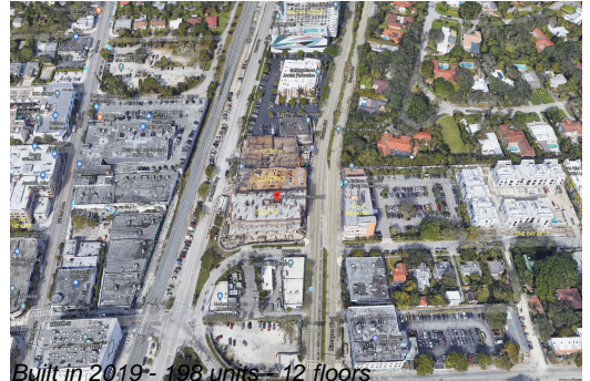
Built in 2019 - 198 units - 12 floors