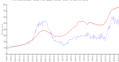
Aventura Beach Club (Ramada Marco Polo) vs Sunny Isles