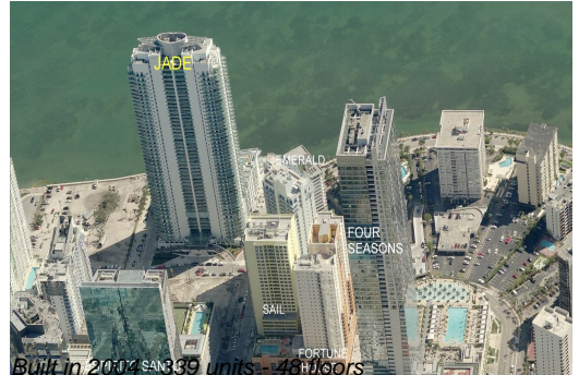
Built in 2007 with 338 units - 40 floors