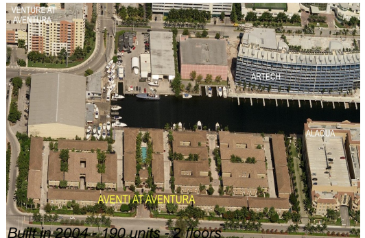
Built in 2004 - 190 units - 7 floors