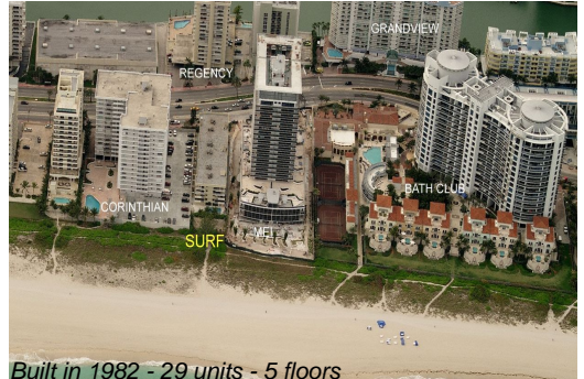
Built in 1982 - 29 units - 5 floors