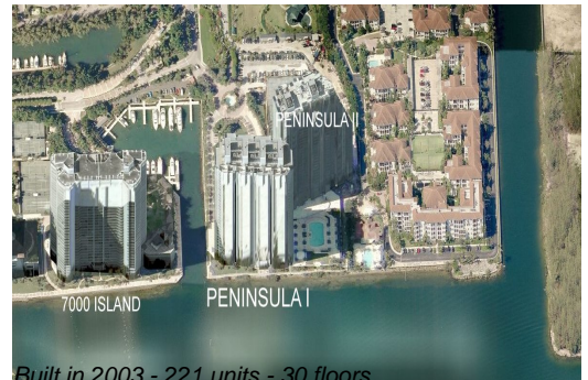
Built in 2003 - 221 units - 30 floors