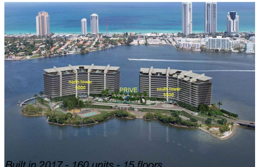
Built in 2017 - 160 units - 15 floors