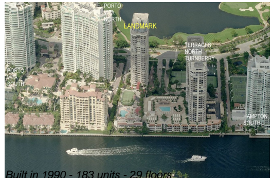
Built in 1990 - 183 units - 29 floors