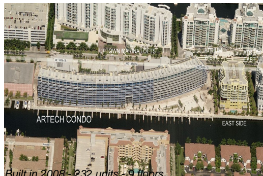
Built in 2008 - 232 units - 9 floors