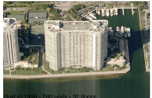
Built in 1998 - 280 units - 32 floors