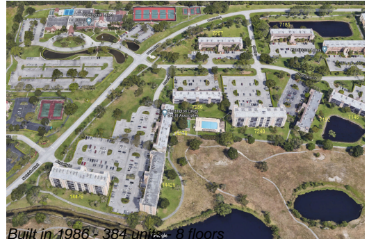
Built in 1986 - 384 units - 8 floors