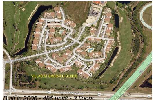
Built in 2006 - 486 units - 3 floors