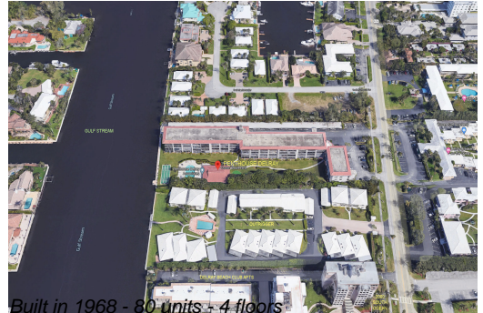
Built in 1968 - 80 units - 4 floors