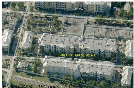
Built in 2004 - 160 units - 5 floors