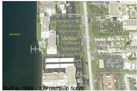
Built in 1968 - 139 units - 6 floors