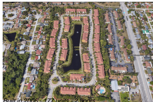
Built in 2006 - 177 units - 2 floors