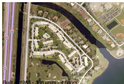
Built in 1985 - 336 units - 4 floors

West Palm Beach: $506/sq. ft. Palm Beach: $453/sq. ft.