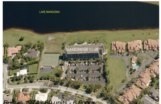
Built in 1974 - 80 units - 6 floors