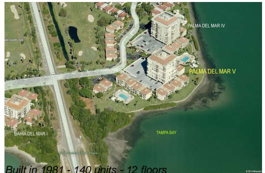
Built in 1981 - 140 units - 12 floors