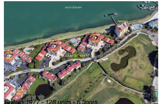
Built in 1977 - 128 units - 6 floors