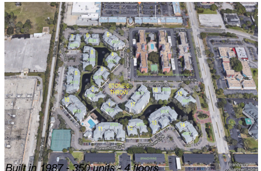
Built in 1987 - 350 units, 4 floors