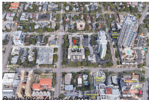
Built in 1982 - 74 units - 6 floors