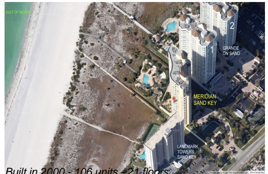
Built in 2000 - 106 units - 21 floors