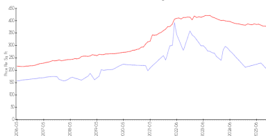
Columbia Towers (Sea Towers) vs St Petersburg