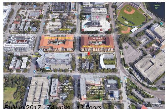
Built in 2017 - 74 units - 13 floors