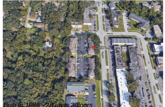
Built in 1986 - 28 units 2 floors