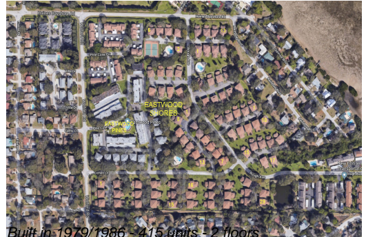
Built in 1979/1986 - 415 units - 2 floors