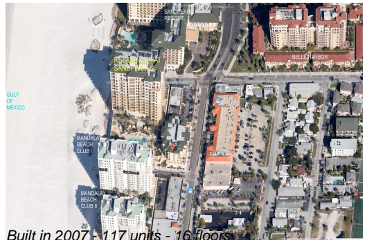
Built in 2007 - 117 units - 16 floors