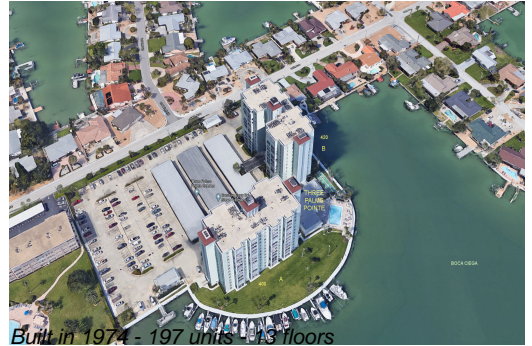
Built in 1974 - 197 units - 13 floors

The above valuated price is a baseline figure that does not take into account any specific renovation, upgrade, split, merge, or deterioration of the unit.