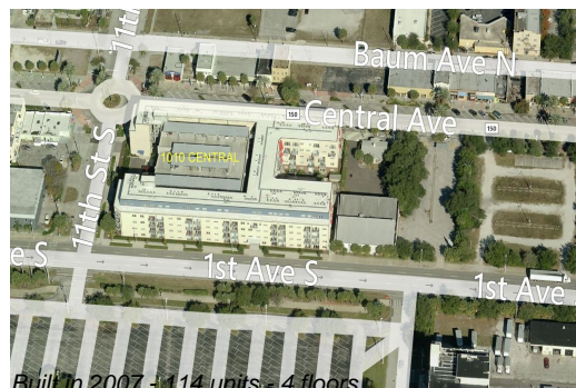
Built in 2007 - 114 units - 4 floors