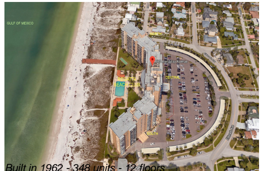
Built in 1962 - 348 units - 12 floors