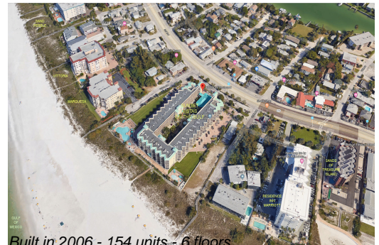
Built in 2006 - 154 units - 6 floors