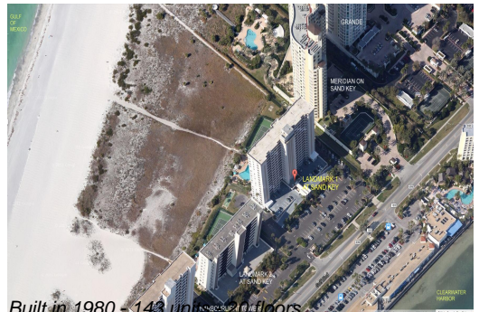
Built in 1980 - 143 units, 10 floors